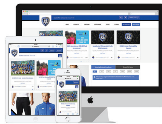
Coquitlam Metro-Ford Soccer Club